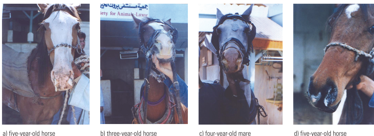
Fig. 2 Equine influenza virus-infected horses with heavy mucopurulent nasal discharge