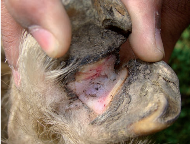
b) Separation of the hoof wall and sloughed off surface of the foot pad