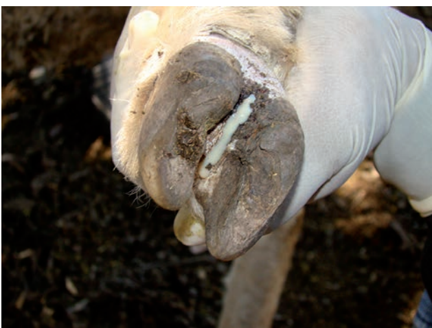
Fig. 2 Severity of various foot lesions in goats

Oligonucleotide primers used in the present study were procured from M/S Integrated DNA Technologies, Inc., USA. Deionised water was used as a control. Amplification was carried out in a GeneAmp PCR System 9700 Thermal Cycler (Applied Biosystems, USA).