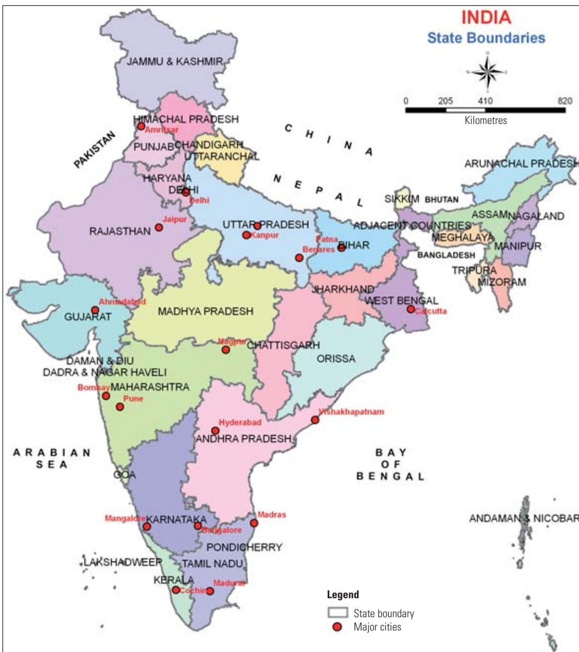
Fig. 1 Map showing states of India