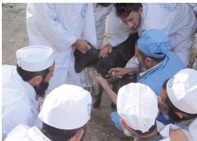
Fig. 3 A para-veterinary training centre in Jalalabad, Afghanistan, October 2008

In many countries, government veterinarians, veterinary para-professionals and other public animal health officials are the primary deliverers of VS. In others, however, the government workforce is augmented through partnerships with private-practice veterinarians and para-professionals. This is particularly true in more developed countries, in which fee-for-service is the accepted model for both companion and food animal veterinary practice. Here,