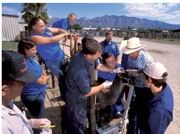
Fig. 1 A veterinarian from the United States Department of Agriculture Animal and Plant Health Inspection Service clips a tiny piece of a third eyelid from a sheep while students hold the sheep

Several international veterinary and animal health organisations (18, 41) have more recently tackled the challenging task of defining global minimum competencies for new veterinary graduates. Development of such competencies must reflect the needs and capabilities of many societies. Consequently, it is a daunting but necessary first step in assessing the effectiveness of veterinary education to provide ongoing workforce capabilities for VS in compliance with international standards. Although only some veterinarians will focus their careers on the delivery of national VS, all veterinarians are responsible for promoting animal health, animal welfare and veterinary public health. Veterinary education is thus a cornerstone to ensure that the veterinary graduate has the required knowledge, skills, attitudes and aptitudes to understand and be able to perform entry-level national Veterinary Service tasks that relate to the security and promotion of animal and public health. These skills, knowledge, attitudes and aptitudes must encompass the basic clinical sciences necessary to detect, diagnose, treat and prevent animal disease (Fig. 1), as well as those skills necessary for active participation in